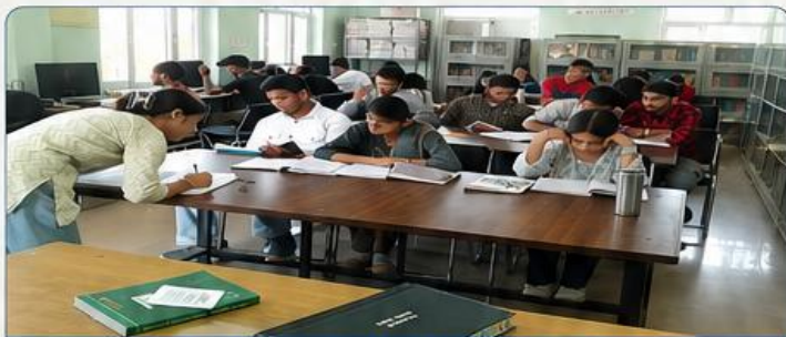
DIGITAL LIBRARY & STUDY AREA